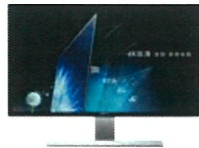
LCD TV (60W) About 6 hours