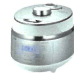
Rice cooker (500W) About 1 hour

*The above data comes from Foxtheon Lab. The test data will fluctuate due to different factors such as environment, usage, equipment specifications, etc. This test data is for reference only*