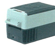
Refrigerator (50W) About 8 hours