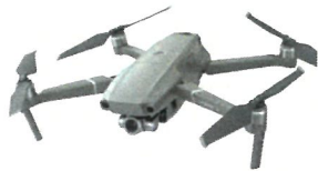
UAV (60W) About 10 times