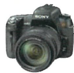
Camera (16Wh) About 25 times