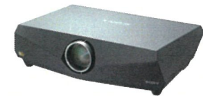
Projector (100W) About 4 hours