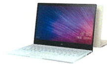
Mac book (60Wh) About 7 times